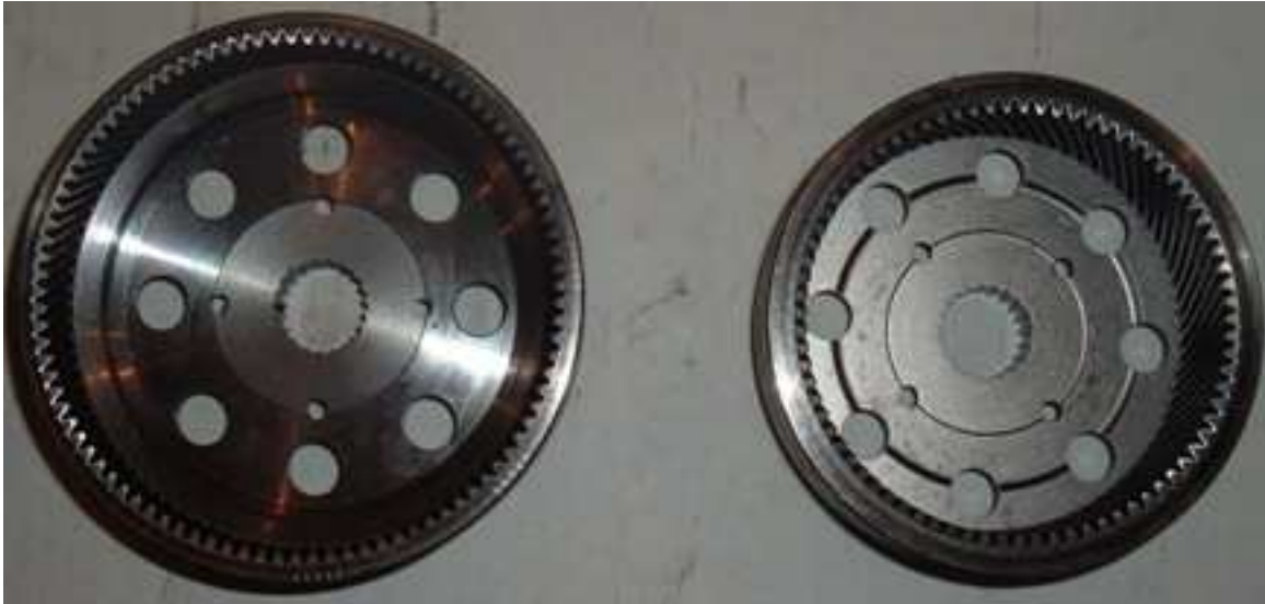
31 Tooth Ring gear

11761 - 156 Street Edmonton, AB T5M 3N4, Canada Phone: (780) 452-8660 Fax: (780) 452-0705 Toll Free: 1.888.452.8660