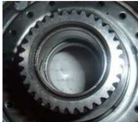
33 Tooth Sungear (2.700 Sungear Outside Diameter)

The outside diameter of the ring gears are 5.280 inches for the 31 tooth and 4.640 inches for the 33 tooth.