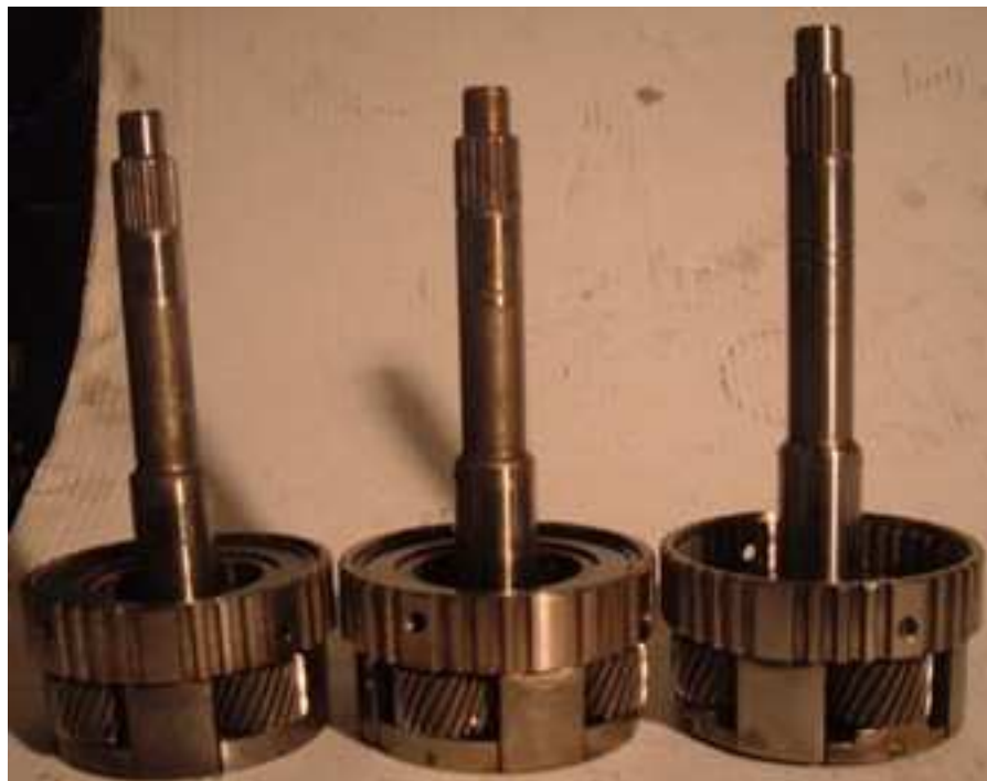
26 spline 8 1/8