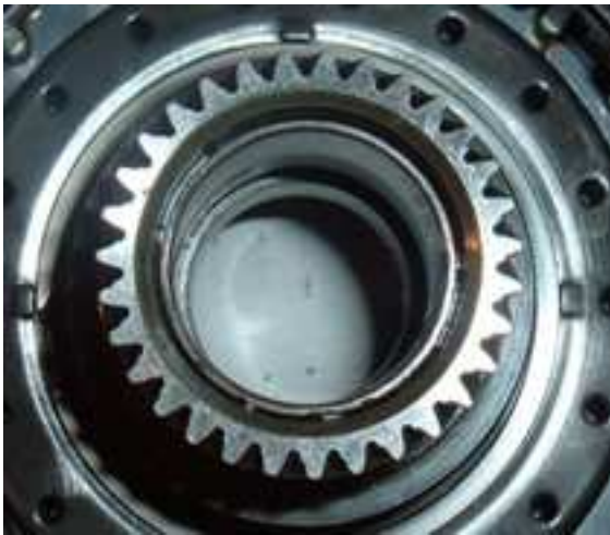
31 Tooth Sungear (2.625 Sungear Outside Diameter)

The sungear will have either 31 teeth (large set) or 33 teeth (small set).